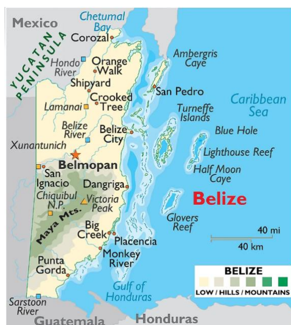
Figure 1: Map of Belize.

Formerly known as British Honduras, Belize is one of a few non-island CARICOM members and is the only English speaking country in Central America. Classified as an upper middle income nation, its gross domestic product (GDP) grew approximately 4.5% in 2023 i . Despite having strong mining potential, Belize has a tourism-based economy where the country's earnings are derived from tourism related services which accounts for 40% of GDP ii . Despite these strengths, as many other developing countries, Belize continues to grapple with persistent socioeconomic hurdles such as poverty which in 2017, was the reality of over one third of the population iii . This poverty is characterized by inadequate access to nutrition, essentials and energy iv .