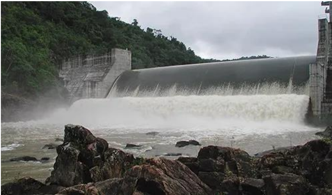
Figure 6: Mollejon hydroelectric generating plant.

With the C-SERMS theoretical target of 76% of generation from RE being so closely aligned with Belize's target of 75% from domestic sources by 2030, and 80% by 2035 xvi , Belize's achievement of the GST recommendation and its pathway to achieving net-zero is well underway. The Government of Belize however still sees the need for grid upgrades and capacity additions to not only progress the country's emission targets but also to ensure that the national need for energy is met in a safe, reliable and cost-effective manner.