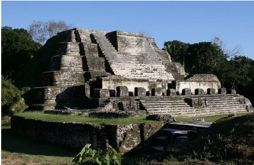
Figure 2: Altun Ha Mayan Ruins.

sectors like coastal zones, agriculture, forestry, tourism, and water security. This was all aimed at reducing emissions by 6,234 ktCO 2 e by 2035 v .